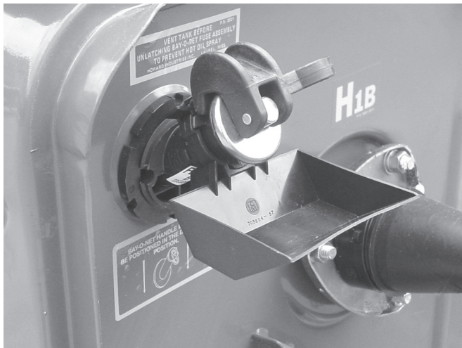
Figure 1: Drip Guard installed in a single-phase pad-mounted transformer.