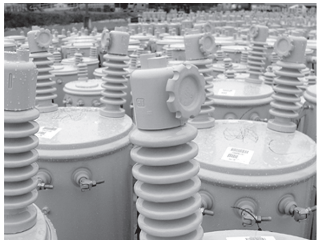
Figure 1: 2140 Wildlife Protectors installed on overhead distribution transformers.

To remove the protector, simply unlatch the protector body and unscrew the handwheel (if present).