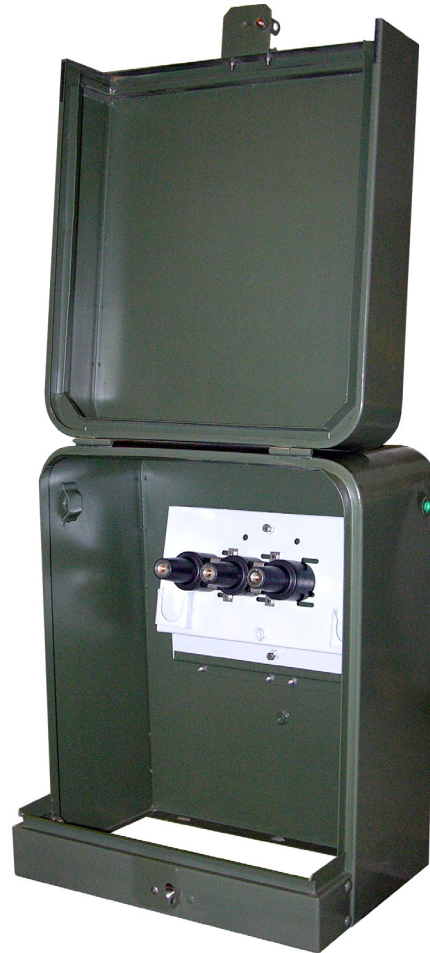
Figure 1: Single-phase junction enclosure (shown with optional switching module installed)